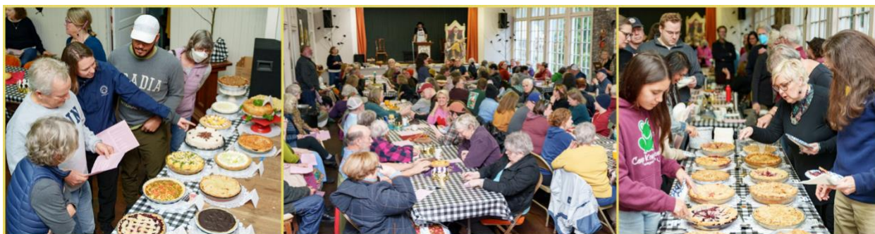
L-R – Guests check out the pies ahead of the auction; The Pie Day auction in action in the packed Hall; Guests enjoy the feast table!

Do you want to see your Grange in the Spotlight? Send a brief write-up of an event at your Grange with a few pictures to Philip Vonada, Communications Director, at pvonada@nationalgrange.org . It may be printed immediately, or may be held for a future Patrons Chain or Good Day! magazine.